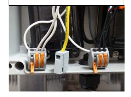
Figure 4: Power wire Connectors