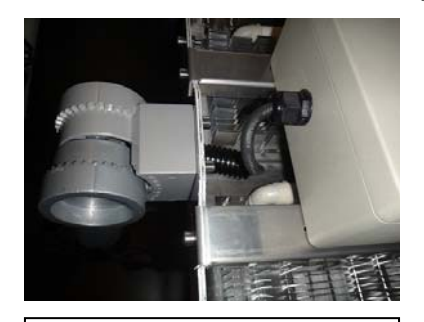
Figure 2: Insertion part sub assembly